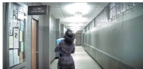
Figure 1 Katherine looking for segregation bathroom for black women

This bathroom scene is just one of many instances in the movie where the characters confront the dual challenges of sexism and racism as they strive to make significant contributions to the space program while enduring discrimination based on their gender and race. "Hidden Figures" sheds light on the struggles these remarkable women faced in their efforts to break down these barriers and make a lasting impact on the field of space exploration.