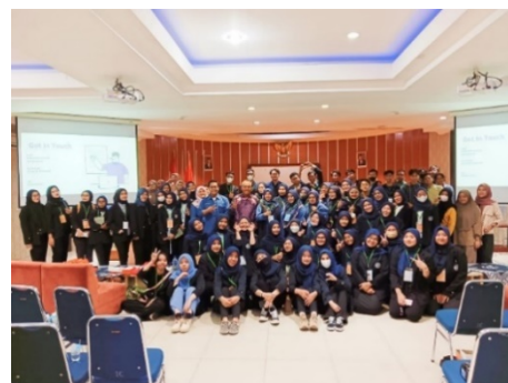
Figure 3 The students From UMT and UAD and the keynote speakers.

In addition, public speaking skills will get better if they practice more. Therefore, speaking skills are trained and developed to improve the ability and skills to talk to the students.