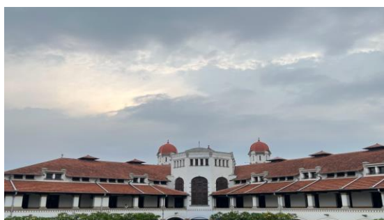
Figure 1. Lawang Sewu