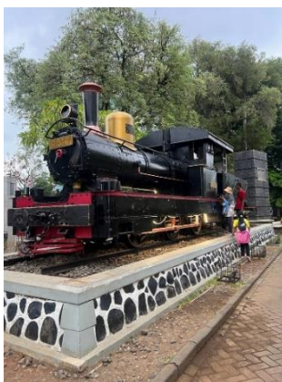
Figure 5. Locomotive

In this photo, there is a locomotor of kereta api that is labeled C 23 01 in the lower left corner of the Lawang sewu. There are a few nearby tourists that display the