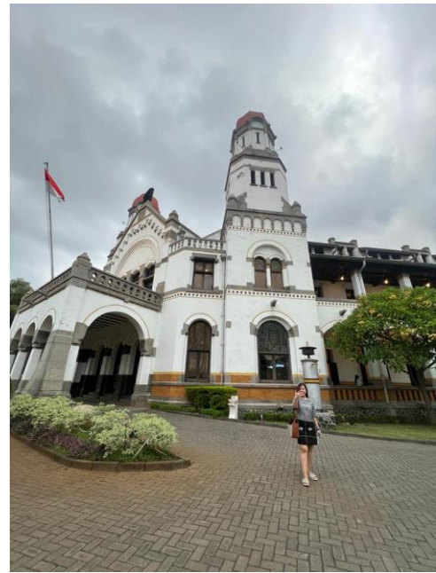
Figure 4. Lawang Sewu main building

The building that consists of two floors and one attic is used as a work area and is the primary structure that is most visually appealing among the other structures, both in terms of bulk and specific design. Within the area beyond the timur massa "L" in question, there are two lattice bridges connected by a bridgehead to the main lattice. In addition, the construction method used to build the entire Sudut massa of the Lawangsewu park is becoming more dominant when compared to other similar projects (Choirul Amin & Adi Sasmito, 2023).