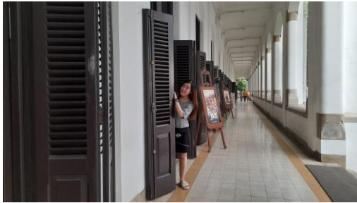
Figure 2. Corridor in Lawang Sewu

community frequently misinterprets it as a pintu (lawang) (Soelistijanto et al., 2018).