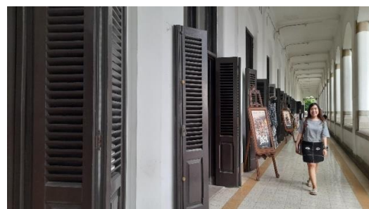
Figure 6. Corridor