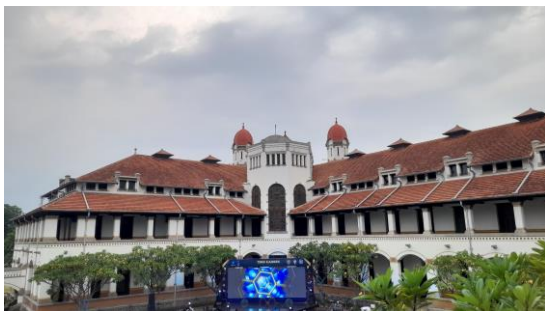
Figure 3. Lawang Sewu

In that particular area, there is a khas menara. Mengapit pintu masuk utama sudut. Comprising of two lattices and a garret as a work area, this structure is the most impressive when compared to other structures based on mass and detail design (Darmawan et al., 2018).