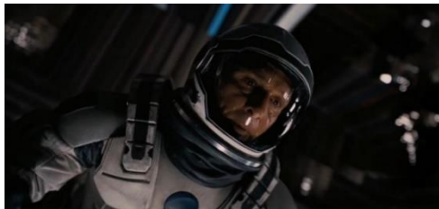
Figure 3. Cooper and Tars trying to cooperate in thinking about the situation

In minutes 01:05:09 –01:06:30, Cooper argues with Robot Tars about the opportunities for humans to survive on earth which Cooper feels obliged to find a solution for it, while Tars does not agree. Figure 3 shows how Cooper thinks about their current situation.