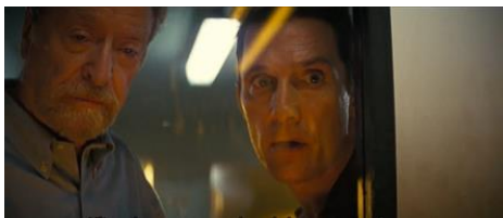
Figure 1. Cooper trying to give Prof. Brand hope.

In minutes 00:29:06–00:29:07, Cooper met Professor Brand and told him about the increasingly critical condition of the Earth's food. Their conversation takes place in the scene visualized in Figure 1.