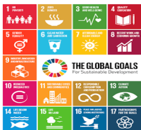
Figure 1. Sustainable Development Goals

Textbook makes the students possible to study what is presented in it and it enables them to review and to be ready with their lesson. Textbooks contribute much to success of teaching learning programs, and it gives positive role for the teachers and students in learning strategies (Crawford, 2011). The using of textbooks provides the structure and syllabus for programs, it preserves the quality of teaching, it offers of variety resources of teaching, also provides effective language design for the students (Miranda & Del Campo, 2016). Through the texts, it can encourage students' interest or can discourage student's willingness in reading. Furthermore, people will be more interested to read about the recent situation they know and deal with what they need to know. In addition, readers with who are familiar with a text's topic can count on what they know to perceive important ideas. By using the appropriate text, the reading will be interesting for the students, and the success of what reading goals will be achieved in teaching learning process. The appropriateness of the texts is dealing with the recent issues in the world.