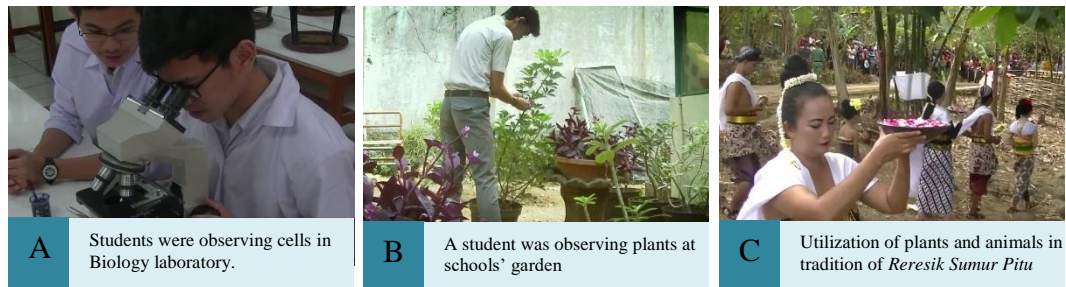
Figure 2. Students' activities in (A) Scientific Approach; (B) Environmental Exploration Approach; (C) Local Wisdom and Cultural Approach.