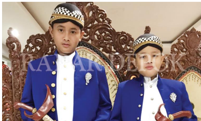
Figure 3 The Duo Puppeteer Brothers

Through continuous activities and practices, in 2018, the duo puppeteer brothers were invited to India and Russia as the Indonesian Cultural Ambassador of the traditional Indonesian puppets (JABARNEWS, May 3rd, 2018). The achievements are the remarkable evidence that the duo puppeteer brothers has shown a Higher Order Thinking Skills (HOTS) level at their very young age (Djiwandono, 2017; Ertürk et al., 2016). The factor of self-motivation contributed the success of their independent learning was the primary aspect that brought them to a great achievement (Putra, 2017). In fact, self-motivation is the key factor of any learning style to attain the best learners' outcomes (Tabiati, 2016; Vibulphol, 2016).