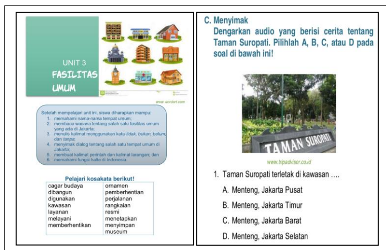
Figure 4 Sample of Learning Material from Sahabatku Indonesia

All in all, the course BIPA program managed by the tutor was implemented eclecticism based on the learner's specific needs in learning Indonesian. The eclectic practices during the session covers the communicative activities/tasks, fluency through dialogues, authentic materials/ realia, deductive grammar and translating exercises, and integration of language skills and vocabulary building. From the eclectic practices implemented on the course, at least, three well-known language teaching methods have grounded the selection of practices. There are Grammar-translation method, Communicative Language Teaching and Task-based language teaching.