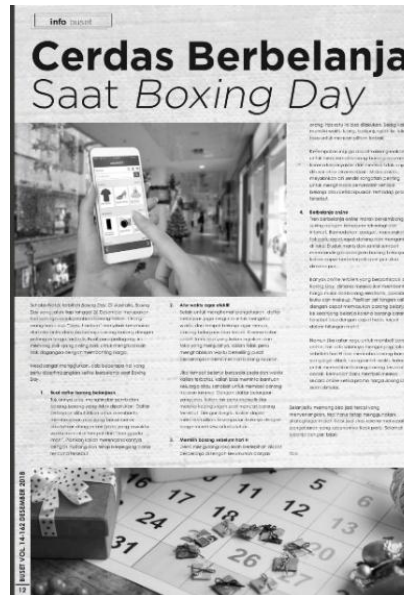
Figure 2 Learning Material from BUSET Magazine

as Cerdas Berbelanja Saat Boxing Day (Fig. 2) and Menikmati Indomie di St. Kilda Festival . Indomie instant noodle was also used for learning materials when tutor asked the learner to write the steps of cooking and review it. Moreover, a tour brochure “Jefanda Wisata” from the coursebook Sahabatku Indonesia looks an authentic brochure. At meeting seven, the learner was asked to listen Indonesian popular song entitled “Surat Cinta untuk Starla” by Virgoun and describe her feeling, impression and interpretation after listening it several times.